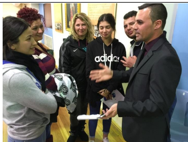
Yr 10 subject selection evening held on 5 th August 2015