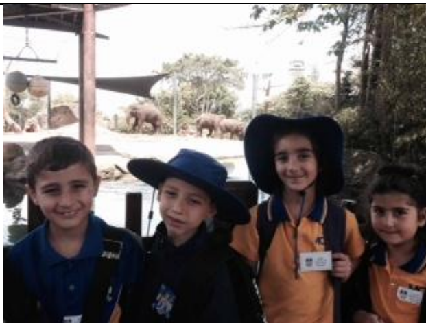
Yr 3 trip to Powerhouse museum 23/10/15