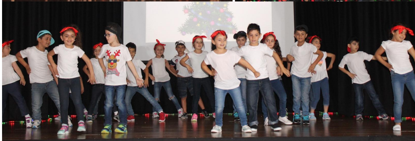
Primary students performed at the Lebanese Flag raising ceremony on 21/11 at Parramatta