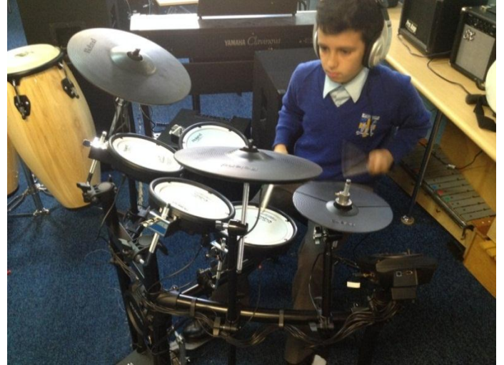
Primary Concert with the theme 'Christmas Celebrations' on 27/11/2015