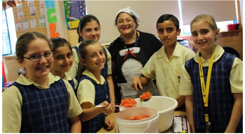
Old Primary canteen has been renovated