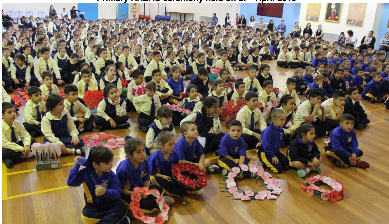
Primary ANZAC ceremony held on 27 th April 2016

Premier's Reading Challenge – Primary students have been given their usernames and passwords. Students keep these details for 2016 and all future participation.