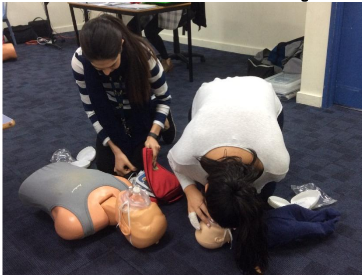
Staff First Aid training held on Tuesday 26 th April 2016