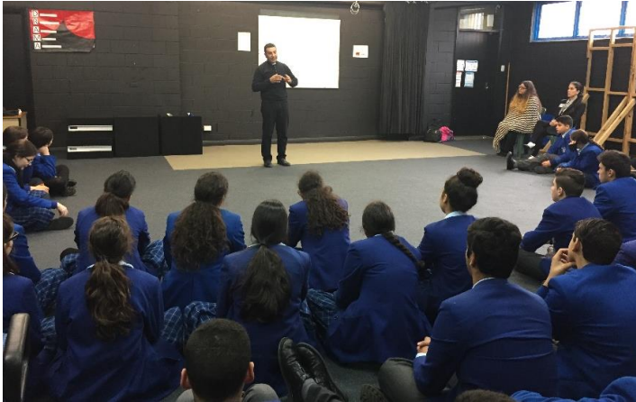
Speakers from Heaven on Earth spoke to Year 10 about caring for the homeless. Yr 11 bullying committee addressing Yr 8 boys