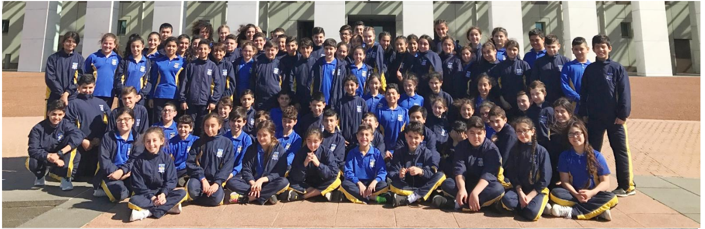
Yr 6 Canberra trip 13-15/9/17