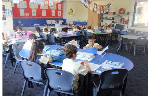
Kindy buddies - Yr 6 students paired up with Kindy and spent the afternoon helping with creative arts