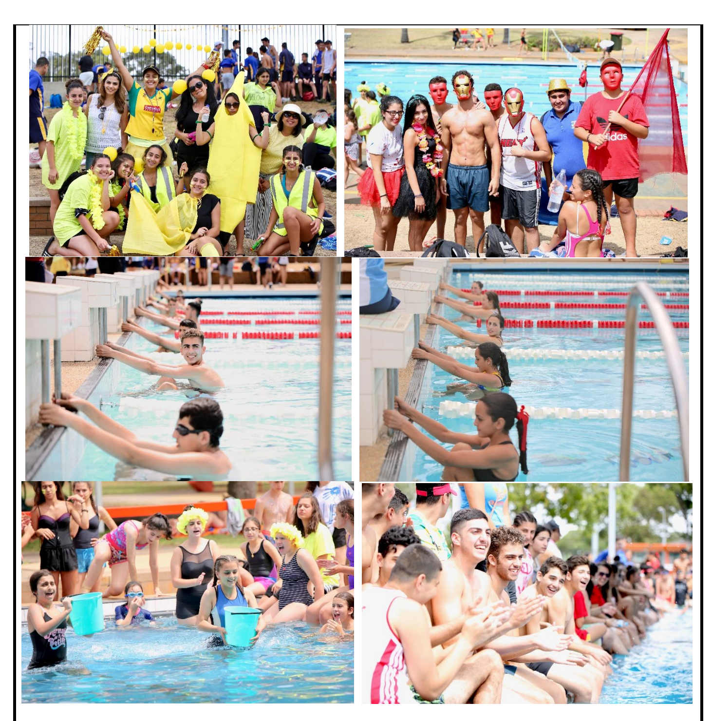
New C Building – Completed mid-June and staff and students will have access to a new learning environment with the latest in technology and spaces that allow for team teaching and collaborative learning. The Secondary will now be on the one campus ensuring better security. Donating Towards New Furniture: The College has partnered with SchoolsPlus to seek donations towards purchasing new furniture. Donations are tax deductible. <a href="https://www.schoolsplus.org.au/projects/modern-furniture-new-secondary-building/">https://www.schoolsplus.org.au/projects/modern-furniture-new-secondary-building/</a>