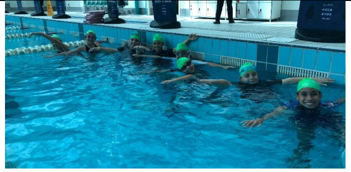
Yr 8 camp from 4-6/4/18