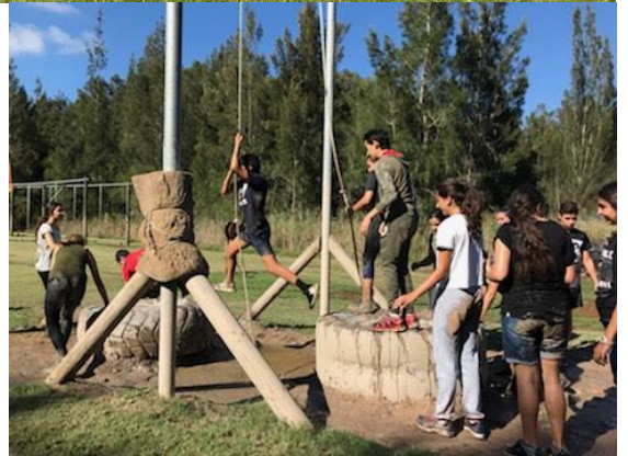
Yr 7 Geo excursion on 4/4/8 to Homebush – Landscapes and Landforms