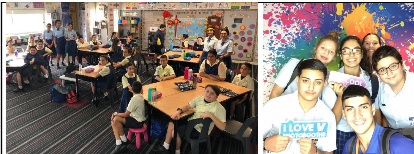
Yr 4 Aqua and Amber students preparing for their First Holy Communion that will take place first Saturday of term 2