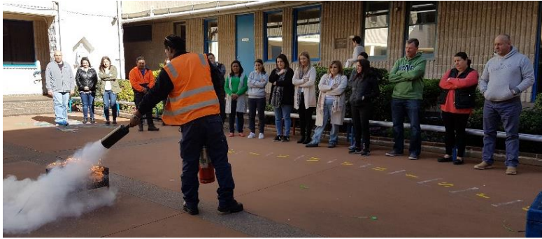
WH&S training for staff on 24/7/18 and Staff professional learning on 24/7/18