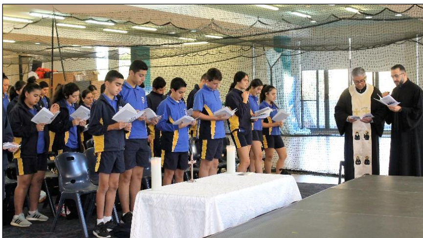
(Above) Year 8 Reflection Day

dynamic reading, note-taking, and conceptual learning. We hope our year 7 students benefited from the session and will apply the advice and strategies presented in their own learning. Further follow up of this session will be held during the year.