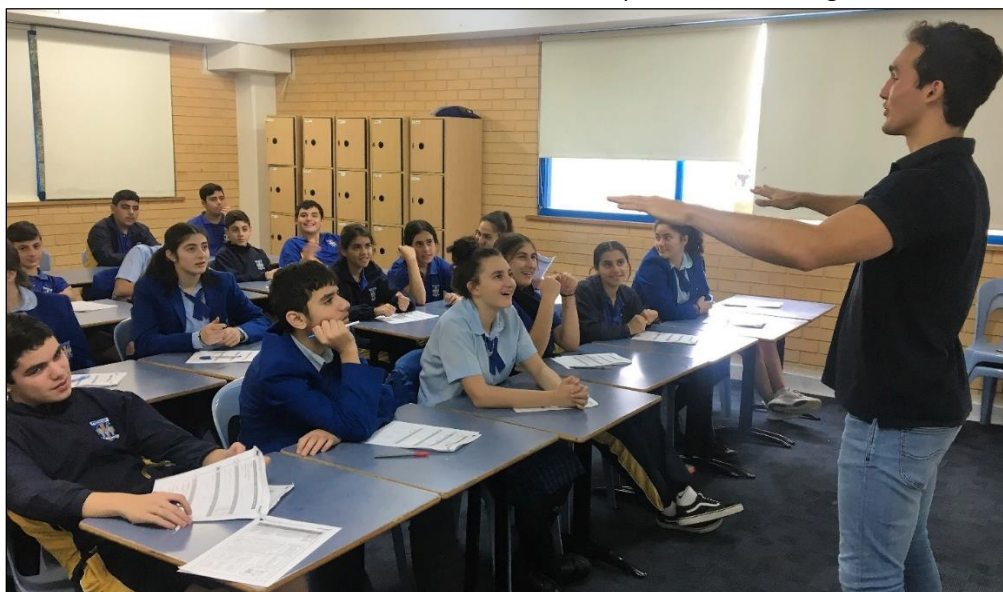
Year 9 Elevate Education Session - Different techniques for memorising content...

The year 12 English Advanced students attended the HSC symposium for the Richard III performance on Monday, during which they engaged in many quality learning activities to strengthen their HSC responses.