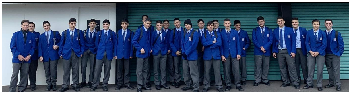
Years 9 and 10 Timber students at the Timber Exhibition, Rosehill

A friendly reminder to parents/guardians that fees for general secondary, subjects and electives, are required to be finalised.