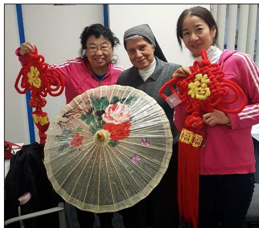
What happens when a Principal from China meets a Principal from Australia? Wonderful exotic gifts are exchanged!