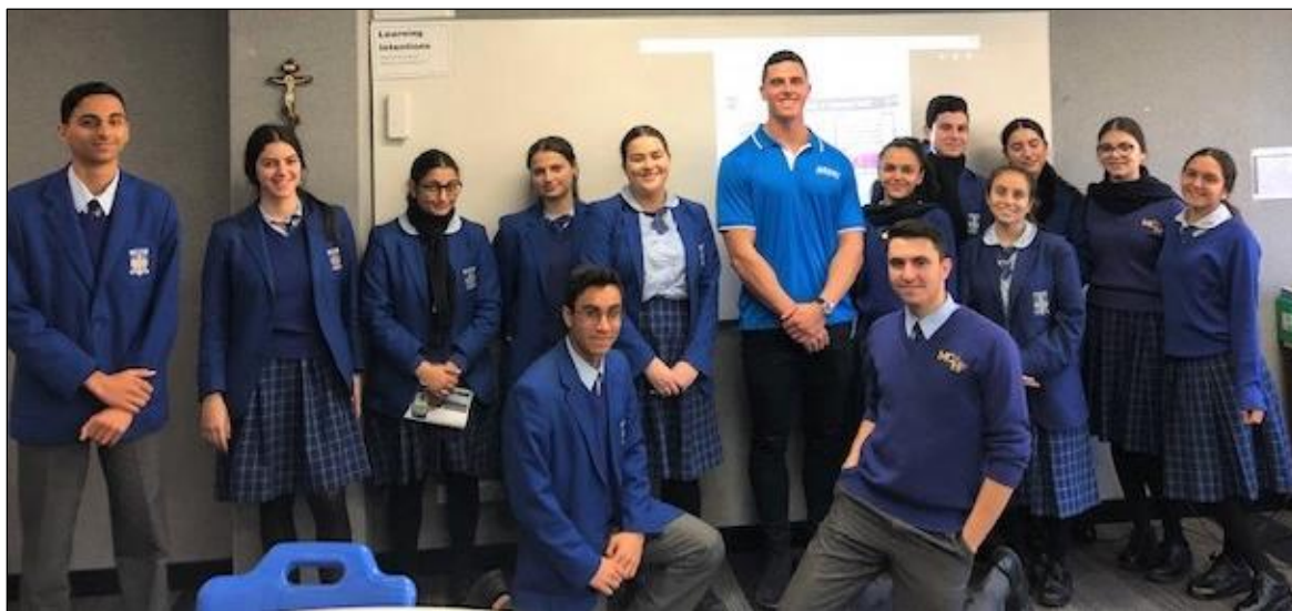
Father's Day morning tea...