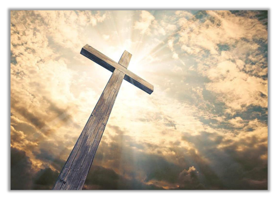
`We adore you, O Christ, and we bless you; because by your holy cross you have redeemed the world'.

On Saturday 14 September, we celebrate the feast of the Exaltation of the Cross. The Cross is our Salvation. It is the bridge from our earthly life to our final destination.