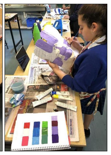
Year 10 and 11 Drama students participated in a workshop on LeCoq techniques. They thoroughly enjoyed being taught how to push boundaries through the use of body and mask.