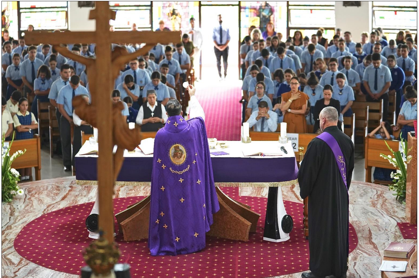
Ash Monday Mass

The College has been working behind the scenes to restore the damage caused by the recent storms. The College phone lines have been damaged as well as classrooms. The Kindy White Classroom was hardest hit but please be assured that the repair of this classroom and the College phone lines is of the highest priority.