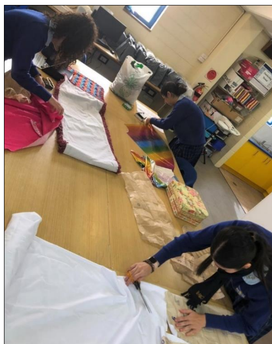
HSC students working on Textiles and Design Major Works.

Year 10 Half Yearly Examination timetable has been released to students. The exams will be conducted online this year and can be completed either from home or if the cohort is scheduled to be attending the College. The links to the exams have been included in the examination