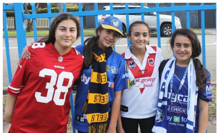
FLASHBACK FRIDAY - Jersey Day, 2017

The SRC are hosting a Footy Jersey Day and Cake Stall this coming Friday 4 th September 2020. Students are requested to wear their favourite Jersey and contribute in this event via a gold coin donation. A cake stall will be set up on the day for