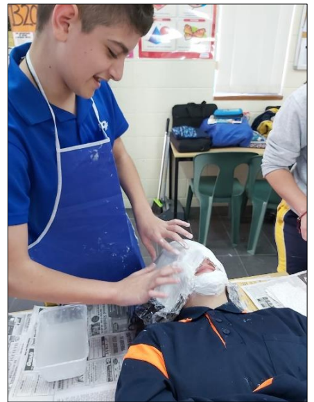
Year 9 Visual Arts students, creating their sculptures using recycled materials.