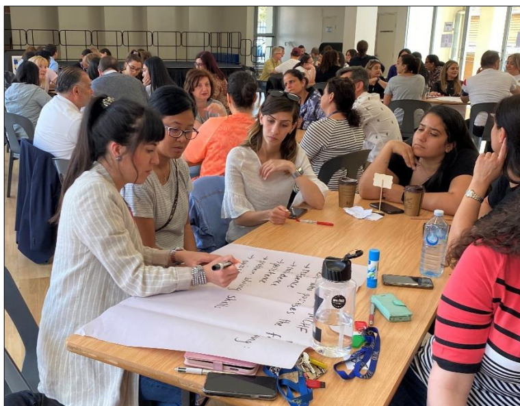
Teacher training for the newly installed CommBox boards