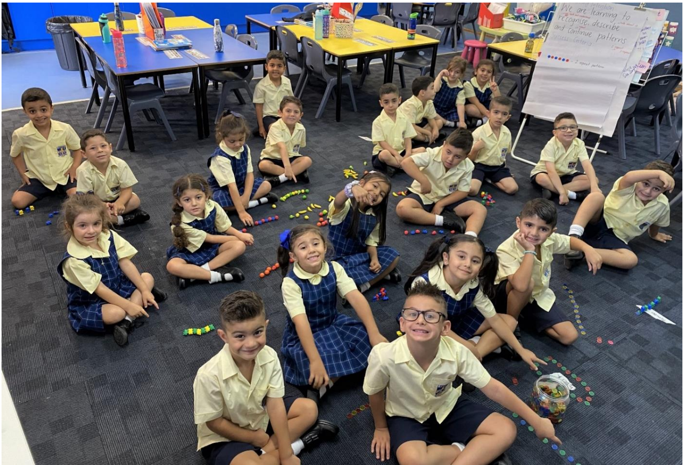
The first of the Religion Sessions that are designed to increase faith in our students.