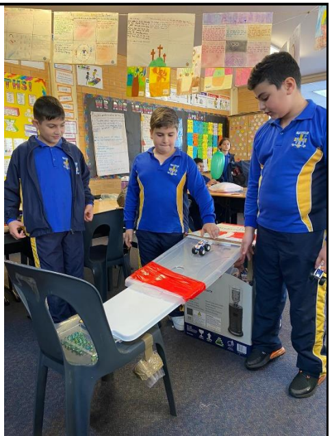
Kindergarten Red and White loved spending time with their Year 6 buddies Friday afternoon. The year 6 students created fun and exciting picture books about their buddies in space!!