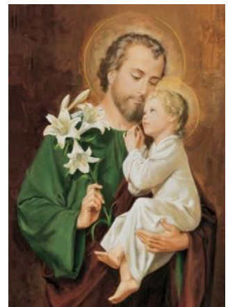
Saint Joseph, pray for us.

"Spread love everywhere you go. Let no one ever come to you without leaving happier." - Mother Teresa