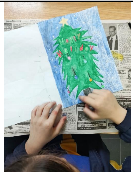
Year 10 Visual Arts students in front of their biggest challenge yet.... Covid didn't stop them! 30 Drawings in 30 days!