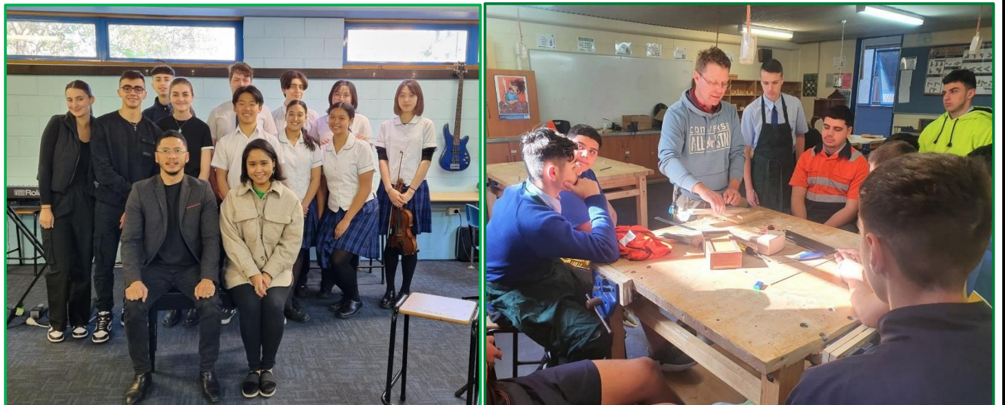
Drama students went on an excursion to Parramatta Riverside theatre to watch Jane Eyre! Year 8 Technology students creating clocks.