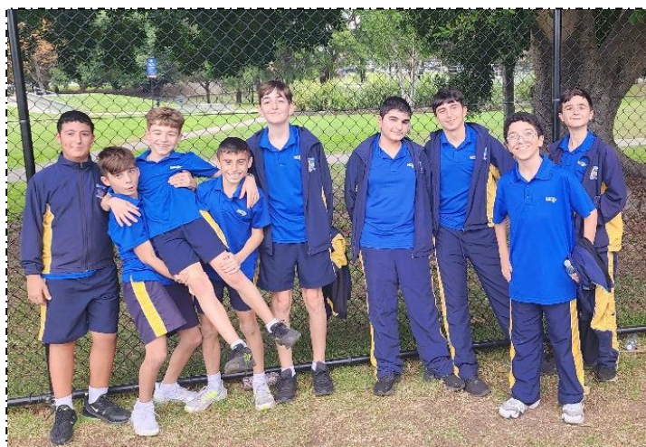
Years 7/8 Boys Touch Grand Final Winners