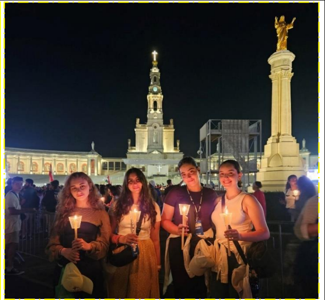
2 Purple and 2 Jade students learnt about Saint Mary McKillop's Feast Day.