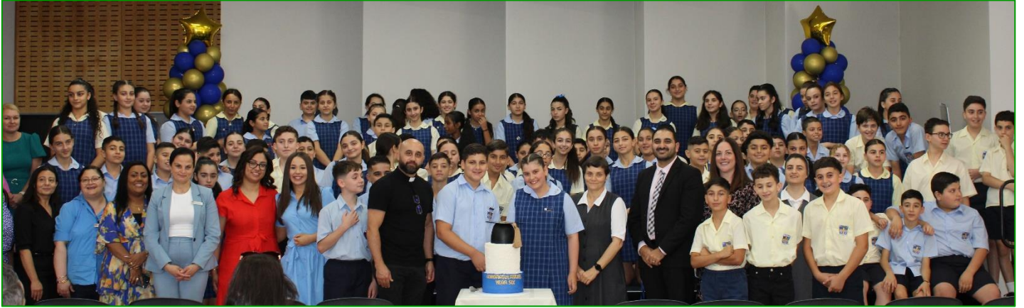
MCHF Expo Extravaganza

Congratulations, Year 6 students, on graduating from Primary School!